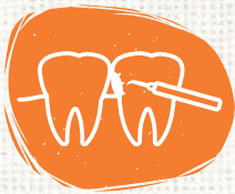
Tooth decay & Gum disease