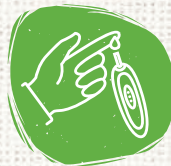
Insulin resistance & diabetes